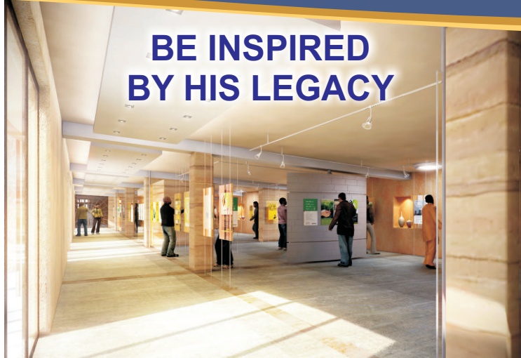
The interior of the Narrative Centre.

October is Tambo Month when the Metro celebrates the life and legacy of Oliver and Adelaide Tambo with a variety of events.