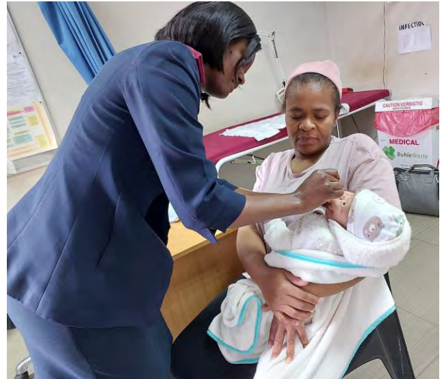
A mother from Katlehong making sure her child receives polio vaccine doses.